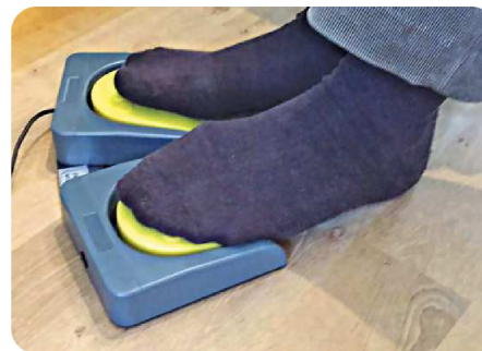
Figure 1 — The left and right clicks on the Docooler PCsensor USB 2 Foot Switch Control Keyboard.

Helpful tools and assistive technology solutions from a ham who has ALS.